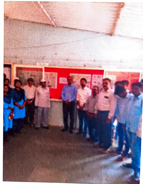
Poster Presentation: Experimental Learning